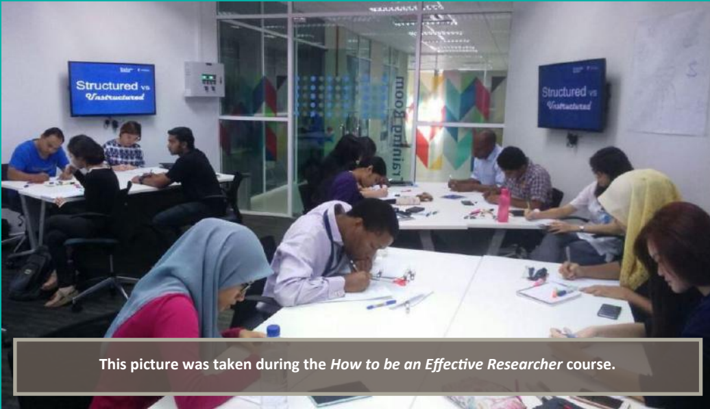
This picture was taken during the How to be an Effective Researcher course.

What do PhD students need to get them started on their research degrees?